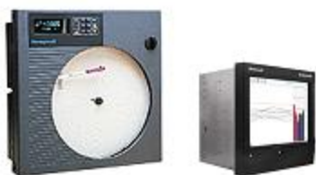
Round Chart & Paperless Recorder