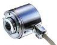
Encoder / Motion Control