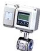
Electromagnetic Flow Meter