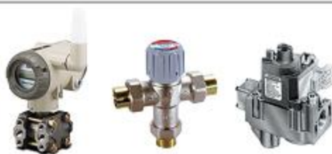
Transmitter & Valves