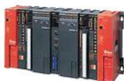
MELSEC A SERIES PLC