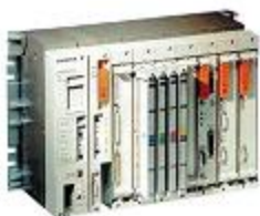
SIMATIC S5 PLC