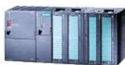
SIMATIC S7-200/300 PLC