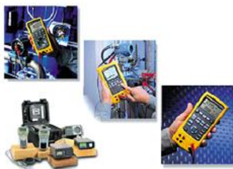
TELCO &amp; NETWORK