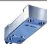
Force, Strain and Pressure Sensors