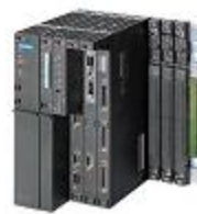
SIMATIC S7- 400 PLC