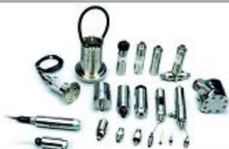
Sensors & Pressure Switches