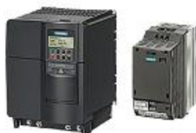
AC DC DRIVE