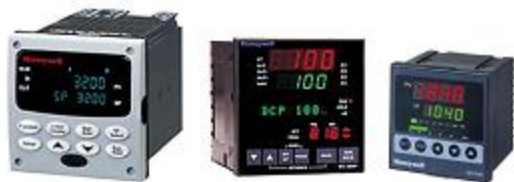
Temperature & Process Controller