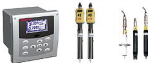
Sensors & Analytical Instrument