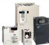
AC DC DRIVE